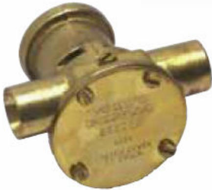
Sea water pump

Fits all small Volvo Penta diesels MD1 – MD17 and all red 4 cyl. gasoline engines