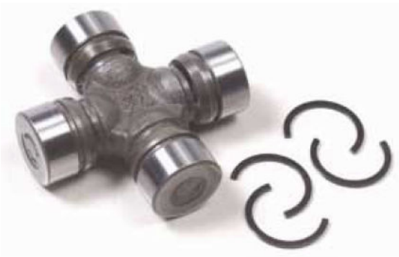
Cross piece for universal joint