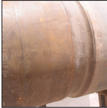
The worn out shaft