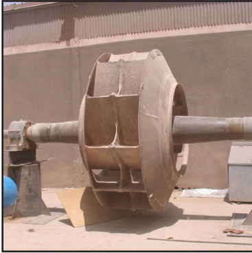
General view of the fan shaft