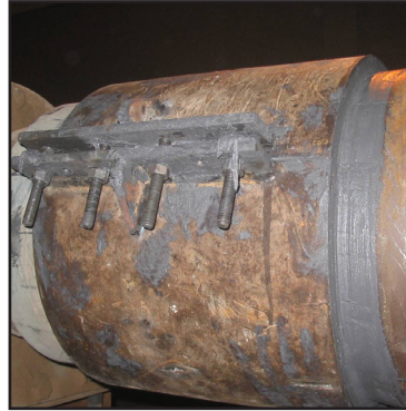
Form was applied