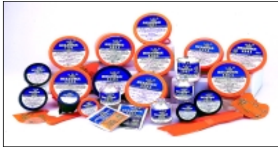
BELZONA® 1000 SERIES METALLIC POLYMERS